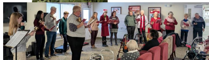
Christmas Caroling 12.7.25