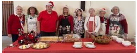
Fellowship hosts 2 nd Sunday lunch 12.14.25

These events are a perfect time to invite a friend to church and then enjoy friendly conversation and a delicious meal. We need to know how many people to prepare for every month, so to reserve your seat, make sure you sign up on the tripod outside the Fireplace Room. Come take the chill off with some warm and delicious offerings on January 11.