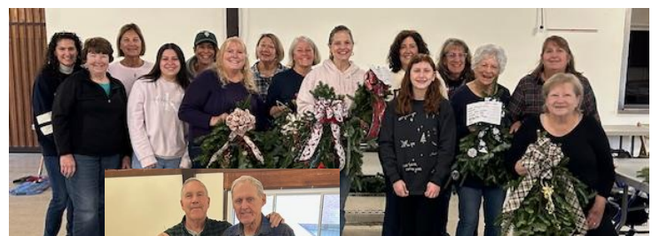
Door sprays 11.22.25