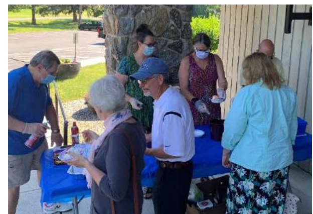
We finished the day with ice cream sundaes for breakfast!